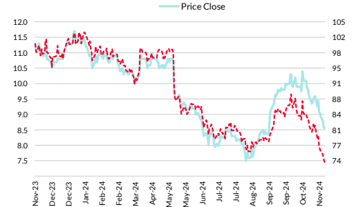
AP Thailand PCL (AP TB)